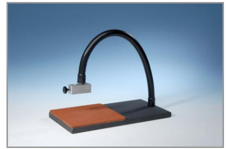
Lightguide Mounting Stand (fits 3 mm, 5 mm and 8 mm lightguides) PN 39700