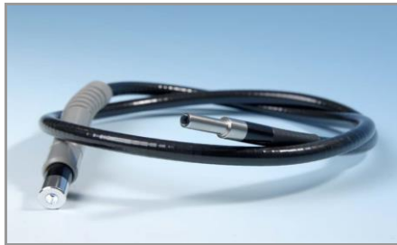
Liquid Lightguides available in 1-, 2-, 3-, & 4-pole configurations (see Table 1 on Page 3 for sizes and part numbers)