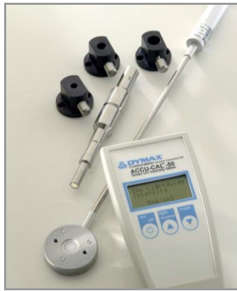
ACCU-CAL™ 50 Radiometer for measuring the UV intensity of spot lamps, flood lamps and conveyor systems PN 39560