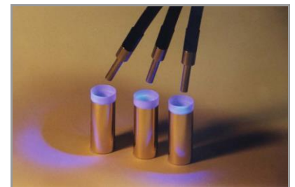
Trifurcated wand curing metal-to-plastic assembly

1 As measured with a Dymax ACCU-CAL™ 50 Radiometer (320-395 nm) and Lightguide simulator. Excessive on/off cycles and improper cooling may affect bulb degradation and therefore no warranty is expressed or implied.