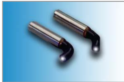
Angled Terminators for Lightguides 3 mm/60° PN 39029 ■ 3 mm/90° PN 39030 5 mm/60° PN 38042 ■ 5 mm/90° PN 38049