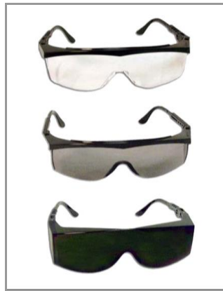
UV-Blocking, Over-the-Glasses Eye Protection Clear PN 35284 ■ Tinted PN 35285 Dark Tint PN 35286